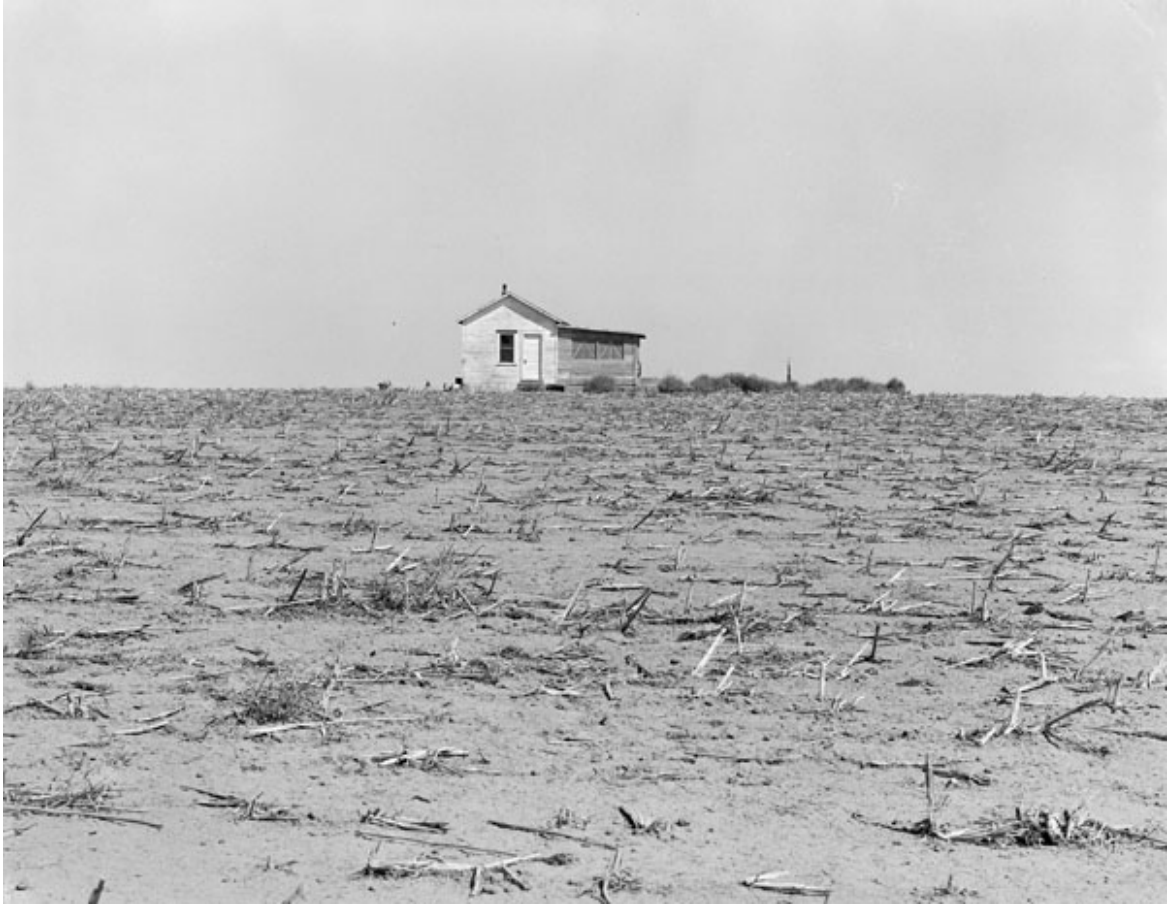
Abandoned house, Haskell County, Kansas