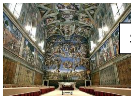
Sistine Chapel - Michelangelo