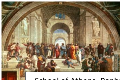
School of Athens- Raphael