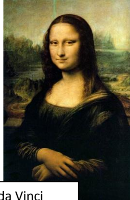
Mona Lisa- da Vinci