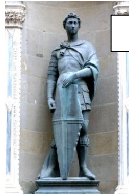
St. George- Donatello