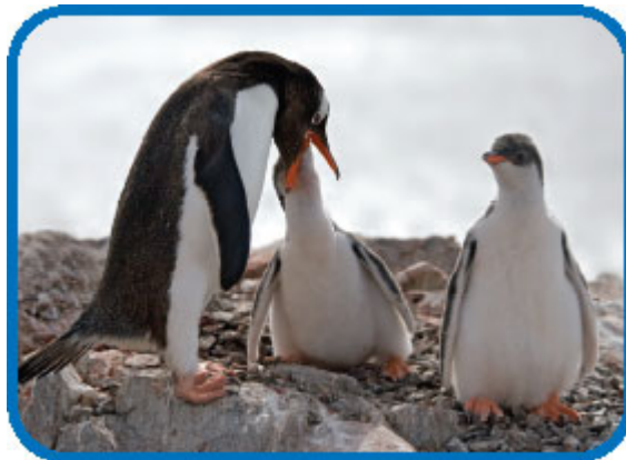
A gentoo penguin feeds its chicks.

On land, penguins walk with a waddle or a hop. They often slide on their bellies to travel over ice or snow. They use their flippers and feet to help them slide.