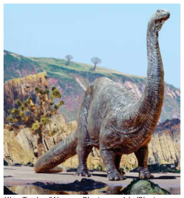
Apatosaurus was a large planteating dinosaur. It used to be called Brontosaurus. It had a very long