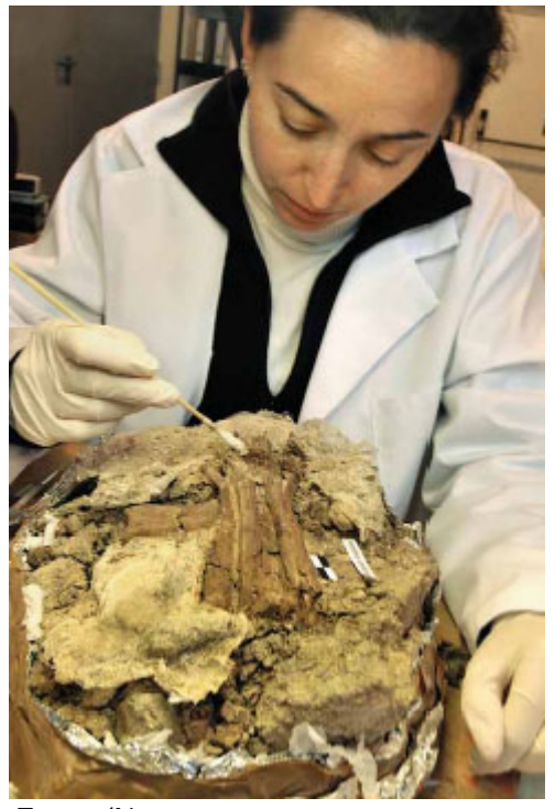
A scientist examines a fossil in a lab.

Dinosaurs died out 65 million years ago. No people were alive during that time. Then how do we know so much about dinosaurs? People have found dinosaur fossils in the ground. Fossils are remains of plants and animals that lived long ago.