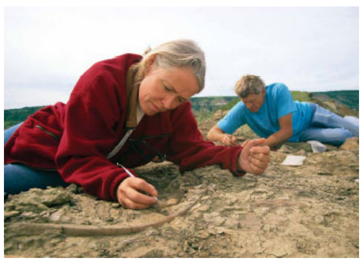
Scientists dig for dinosaur fossils.