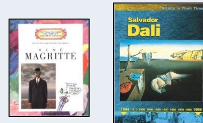
TCR- Comparing Tenniel & Dali PPT

RI 5.5 Compare and contrast the overall structure (e.g. chronology, comparison, cause/effect, problem/solution) of events, ideas, concepts, or information in two or more texts.